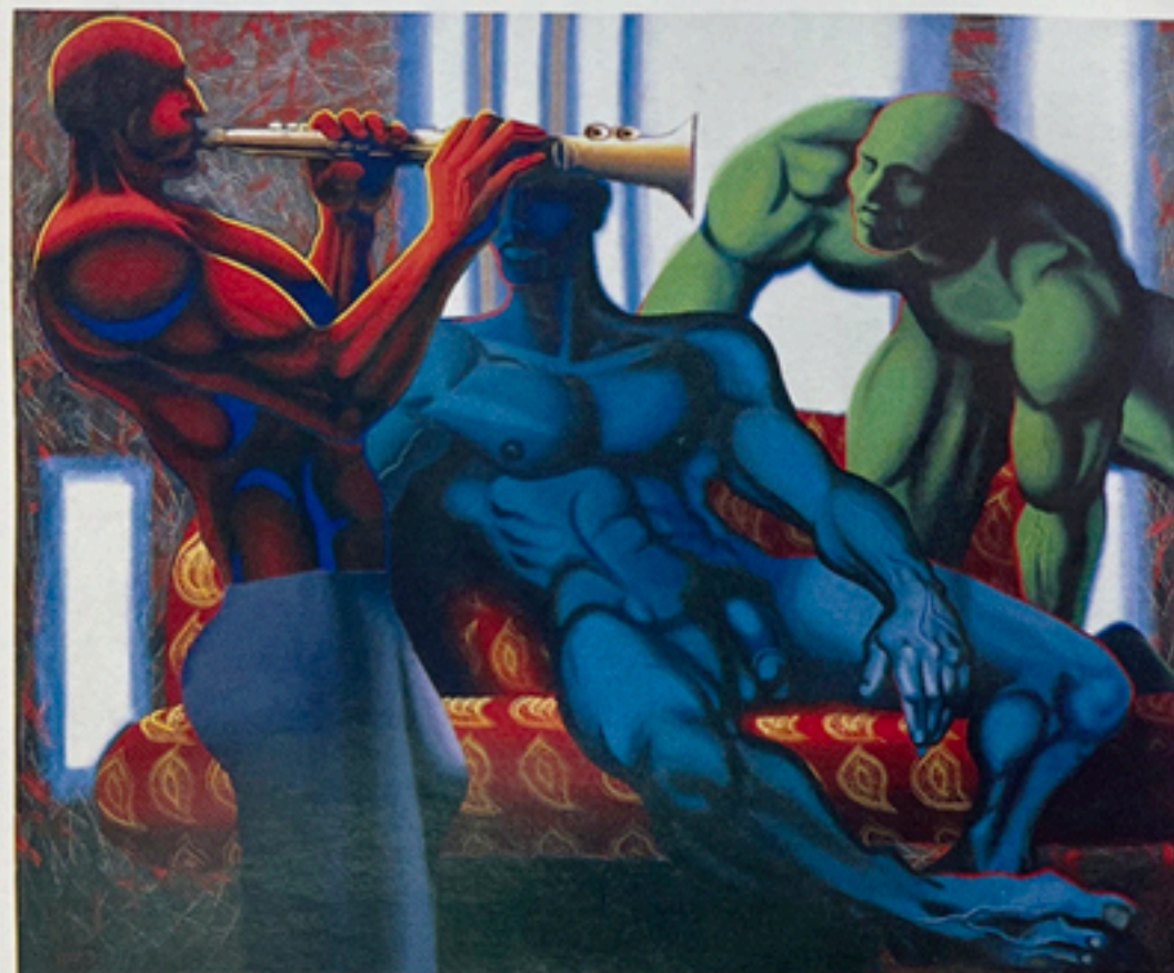
«Neons and Leisure» - Oil on canvas, 80" x 72"

from November 4th to November 29th, 1995